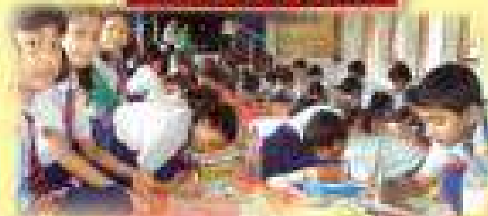
Workshop for class II to X on 15th and 16th December